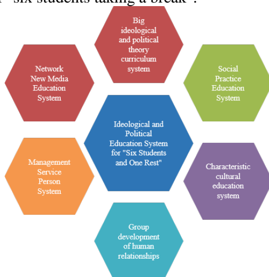
Figure 3 Ideology education system for "six people and one break" students

At the recent National Education Conference, Xi Jinping pointed out that it is necessary to deepen the reform of the education system, improve the implementation mechanism of moral education, reverse the unscientific orientation of education evaluation, resolutely overcome the stubborn chronic diseases of only grades, only studies, only diplomas, only papers and only hats, and fundamentally solve the baton problem of education evaluation. Teachers' ideals and beliefs are the foundation of a good ideology course. Teachers must consciously strengthen theoretical study and ideals and beliefs, so that they can truly stand on the platform and speak the ideology course well. They can also influence, infect and guide students with their own practice. Figure 3 shows the ideology education system of "six students taking a break".